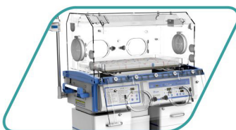
Double wall hood