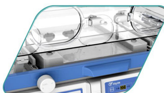
X ray cassette tray&Integrated scale